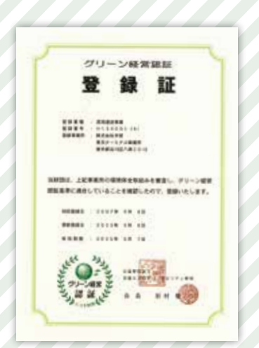
As part of our commitment to limite the burden on the environment, we acquire the Green Management certification for our business management.