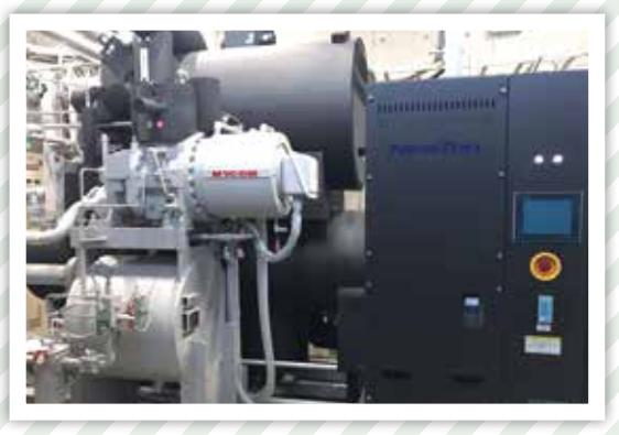
As part of our commitment to prevent global warming, we switch the cooling equipment of cold warehouse from the equipment that uses freon gas, which uses a high greenhouse effect, to the equipment that uses natural refrigerant (non-freon freezer).