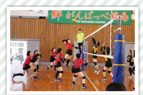
We host a volleyball tournament in Fukushima for club teams and high school teams to promote regional vitalization and friendship.