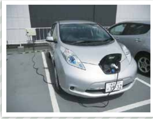
We use electric vehicles as our company cars.