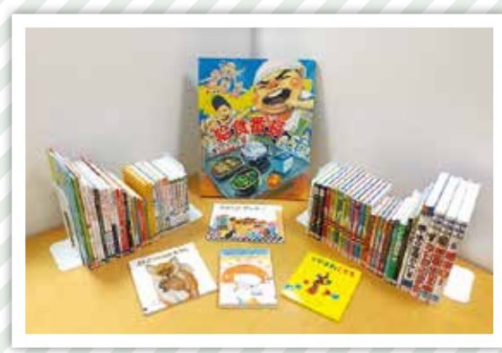
As part of a social contribution activity, we donate children's books to the Yokohama City Library.